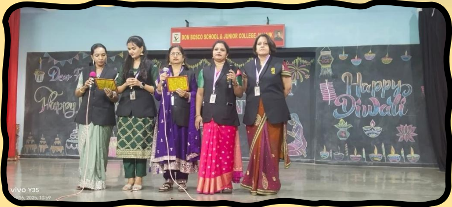
Echoing gratitude on his birthday