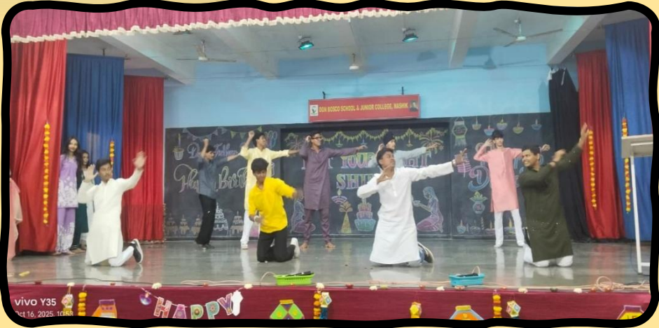
The Guiding Light of Don Bosco, Nashik