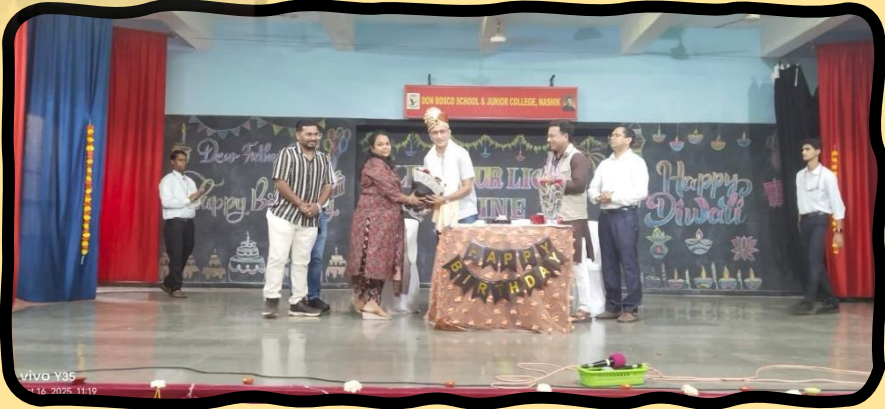
Beloved shepherd of Don Bosco, Nashik