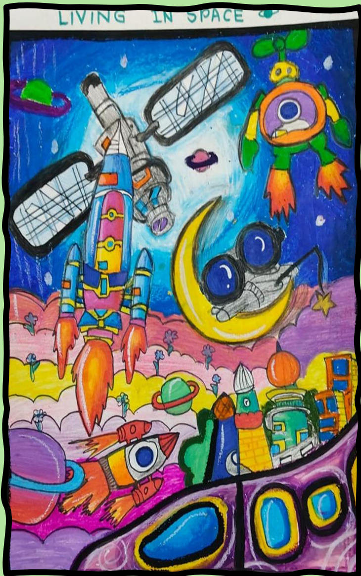
SRUSHTI KARANJE, VI B