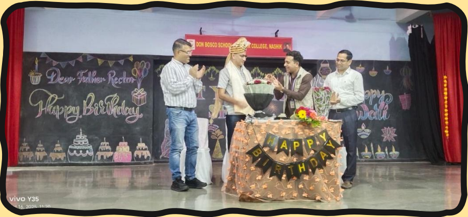
Quiet Leadership & Selfless Service