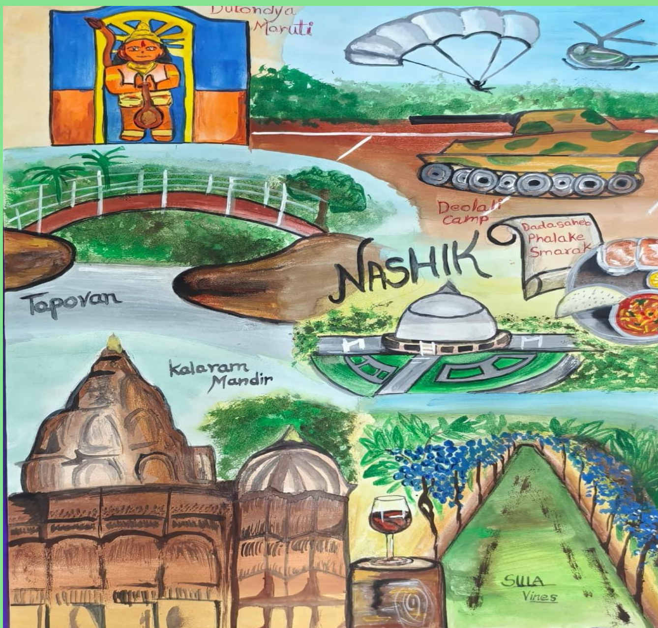
HIRAKSHI SALVE, VII A