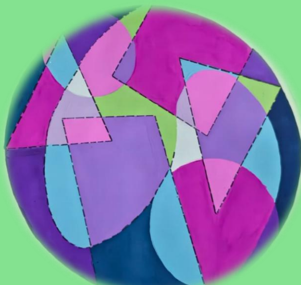
AKSHITA RAUNDAL, VIII B